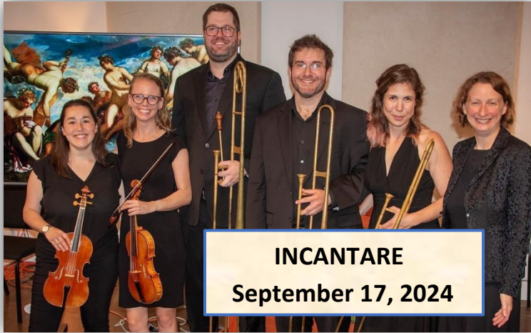
INCANTARE September 17, 2024