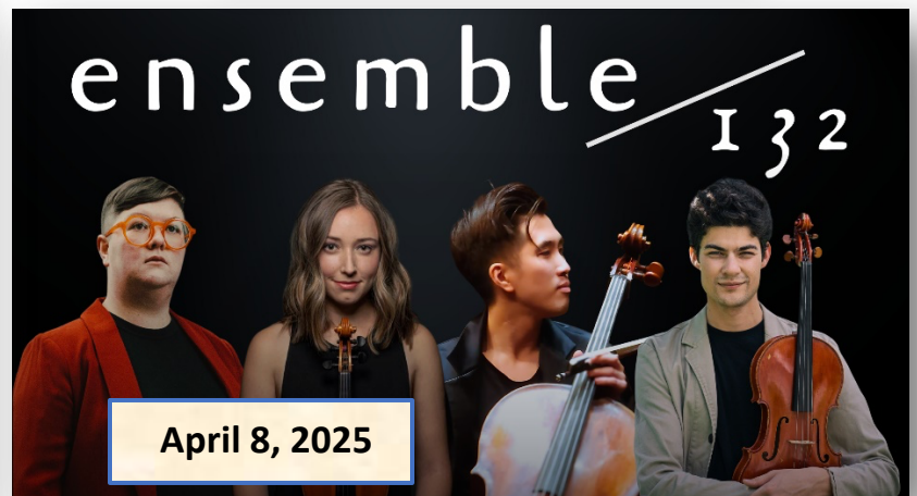
ensemble I 3 2 April 8, 2025

ALL CONCERTS 7:30 PM - ST. JAMES LUTHERAN CHURCH 109 YORK STREET, GETTYSBURG, PA